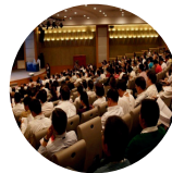
SEMINARS ON COMPOSITES