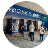
INTERNATIONAL CONFERENCE ON COMPOSITES