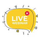
LIVE WEBINARS ON COMPOSITES