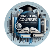
SHORT TERM COURSES